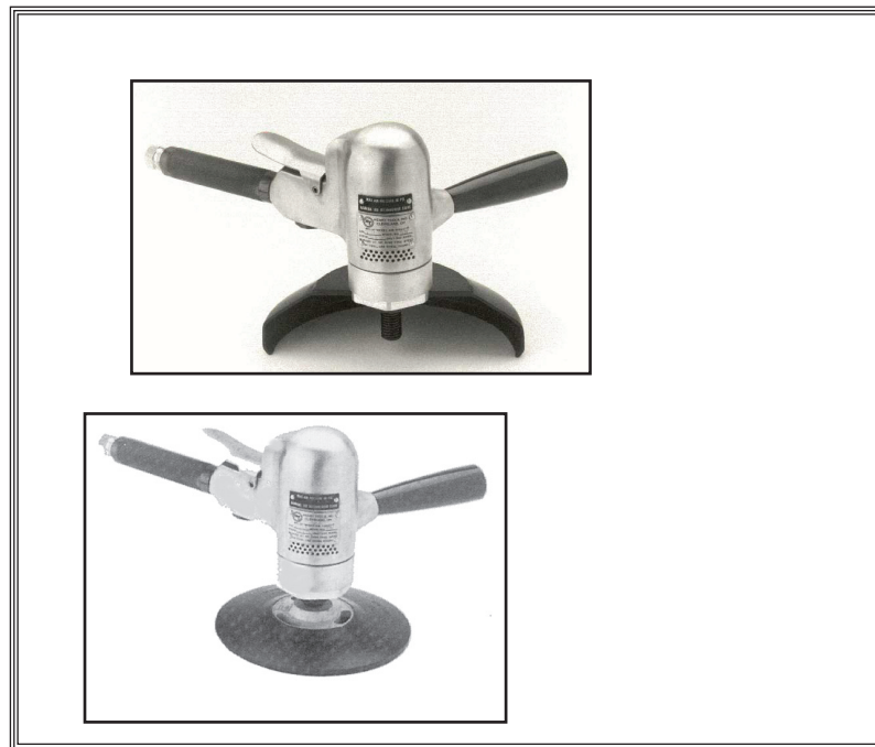
1.5 H.P VERTICAL GRINDER/SANDER