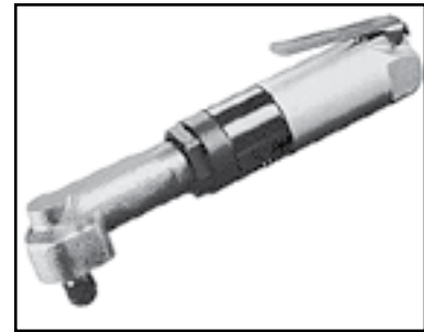
MODEL 46RAS shown with 4" Guard.