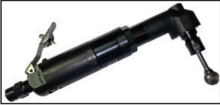
Model 46ARAD Angle Grinder featuring an Erickson style collet for carbide burrs, etc.