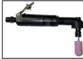
Model 46ARAD Angle Grinder featuring an Erickson style collet for carbide burrs, etc.