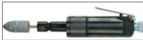
Model 4123GLS Die Grinder.