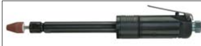
4123GLS+6" Model with super extended length spindle shown above.